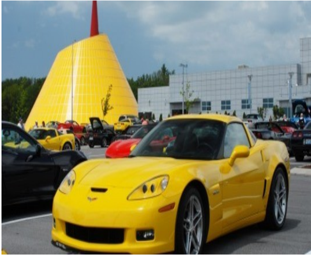
Last 2019 Stingray