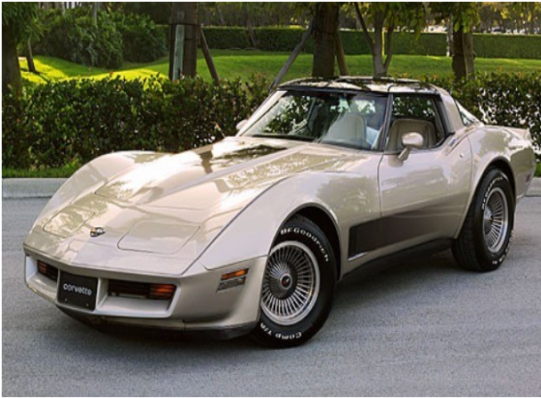
1982 Collectors Edition Barb McCracken